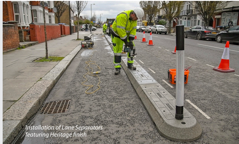
Installation of Lane Separators featuring Heritage finish