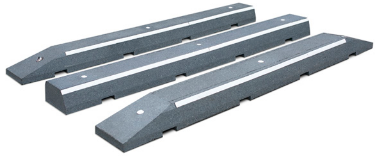
Narrow Cycle Lane Defenders